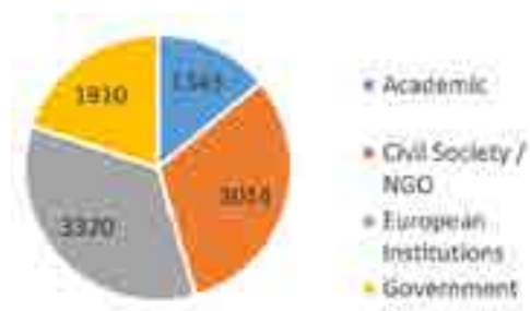
Composition of Capacity4Dev

The development of the community of practice was supported by the following activities: