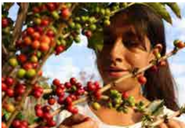
The different faces of the the informal economy

For any request related to the RNSF project starting from January 2019, please contact A.R.S. Progetti at: s.bove@arsprogetti.com