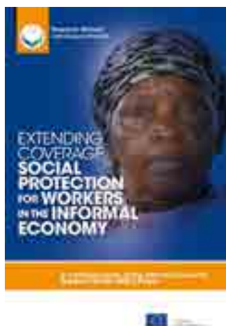
RNSF book on Social Protection

• Volume 5 presents the results of the Regional Workshop held in Kenya, presenting recommendations, innovative ideas and approaches on Social Protection from the perspective of the Informal Economy, addressing the question: “How to promote social inclusion for informal workers?” The book is entitled Extending coverage: Social protection and the informal economy. Experiences and ideas from researchers and practitioners and is available on the IESF Group .