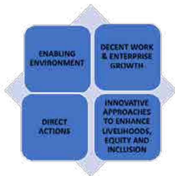
RNSF Research Areas

Volume 2, Defining the Informal Economy, is dedicated to significant and practical definitions of the Informal Economy and its dimensions and phenomenology. It presents the most recent overview of key concepts related to the Informal Economy as long with the most available statistical figures for more than 90 countries.