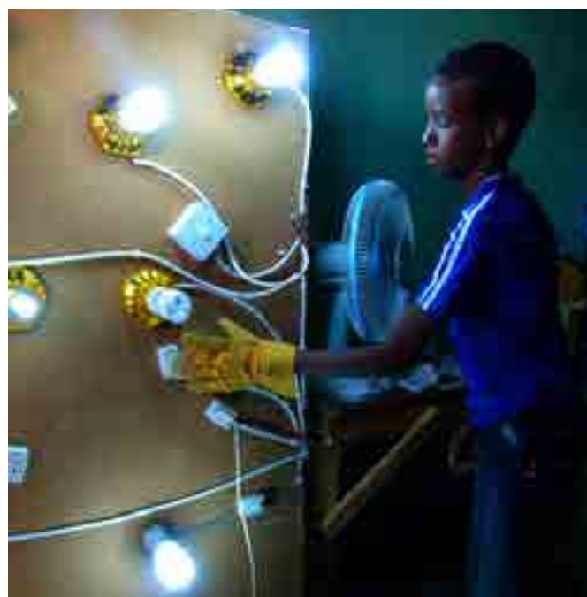
Connecting the dots of the informal economy

Finally, the digitalization of the RNSF research volumes allows to make them available on DEVCO Academy where all the research materials will be available for further dissemination to DEVCO staff, EU Delegations, and other stakeholders.