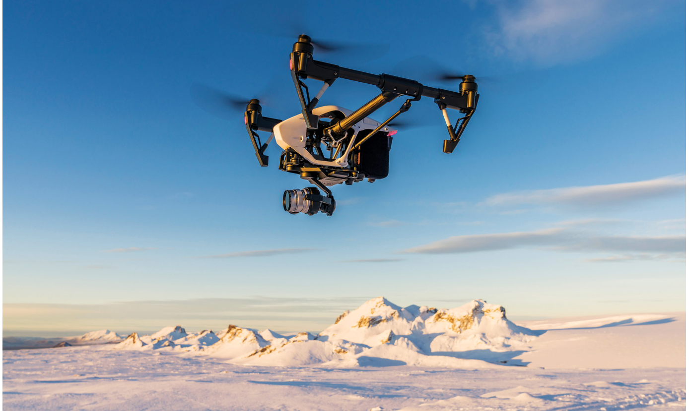
Drones can survey hostile and difficult-to-reach terrain.